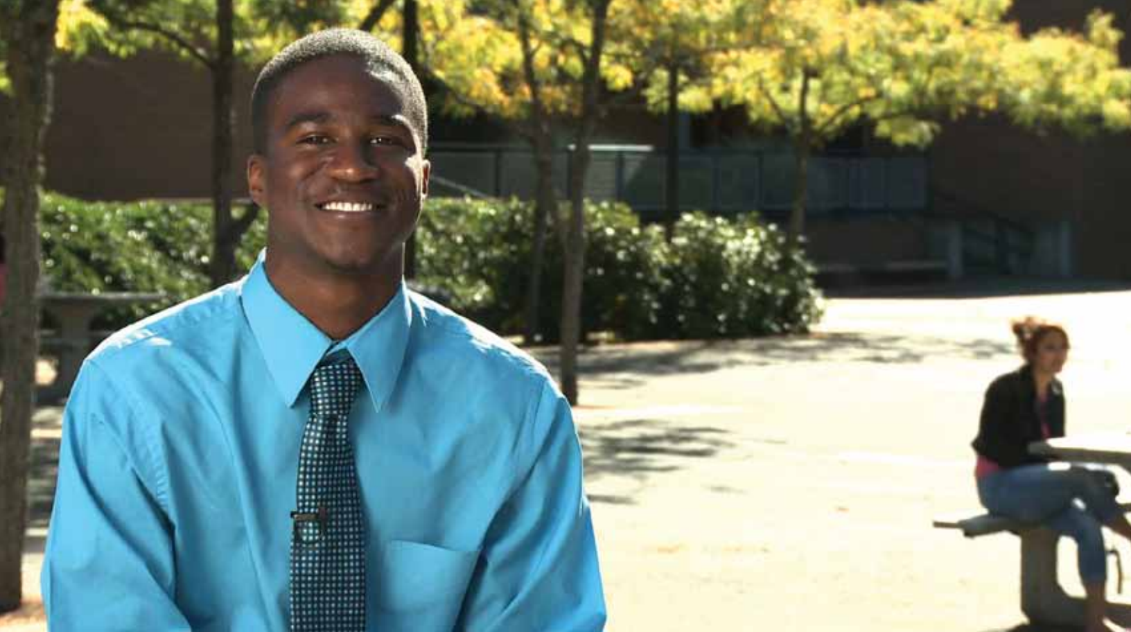
North by Northwest/Non-Fiction © 2011